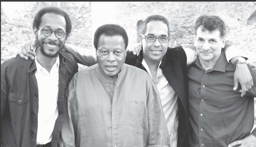
Brian Blade, Wayne Shorter, Danilo Pérez, and John Patitucci

Brian Blade, Danilo Pérez, and John Patitucci