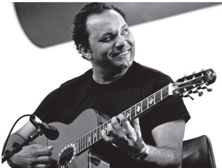
BIRÉLE LANGRÉNE