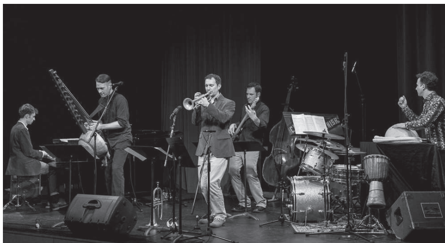
THE KORA BAND