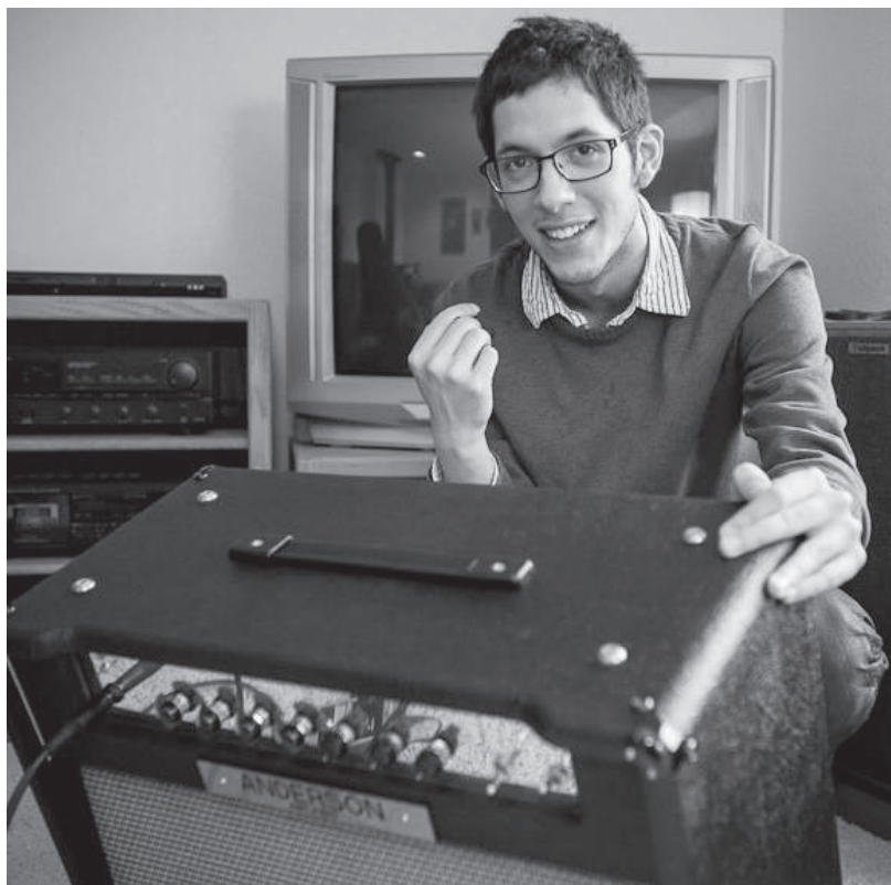
GREGG BELISLE-CHI