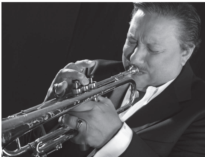
ARTURO SANDOVAL