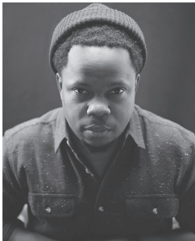
AMBROSE AKINMUSIRE

His tuneful, savvy compositions, comprehensible within well-known quarters of the art form and yet rich with fresh perspectives, have earned him a commission from New York's Jazz Gallery and grants from the Rockefeller Foundation's MAP