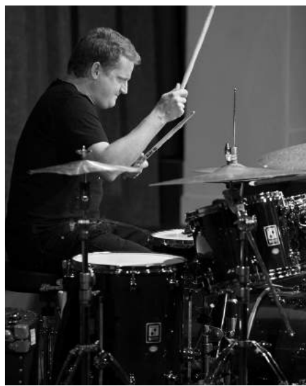
JIM BLACK