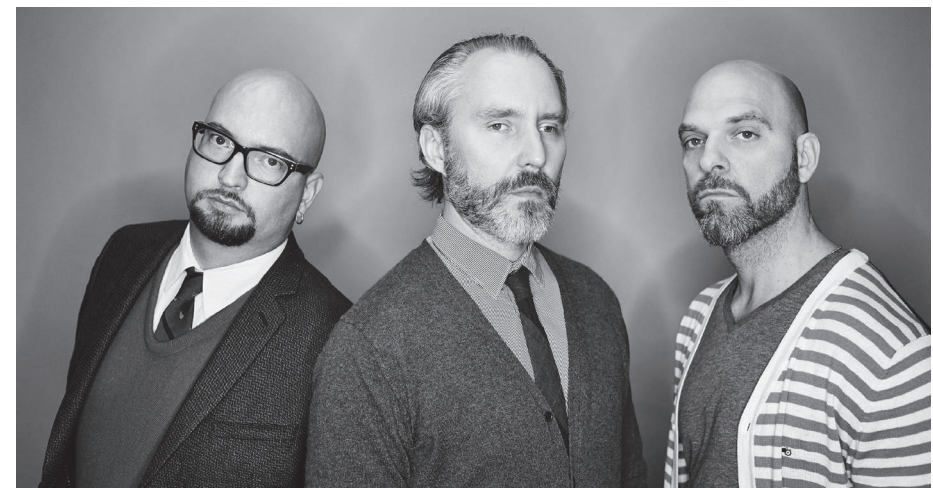
THE BAD PLUS

Earshot Jazz is seeking volunteers for the 26th annual Earshot Jazz Festival, October 10-November 11. Please see earshot.org/Festival/festival.html for more information.