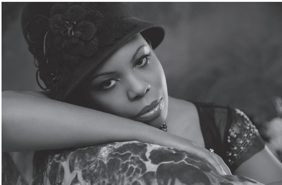
REGINA CARTER