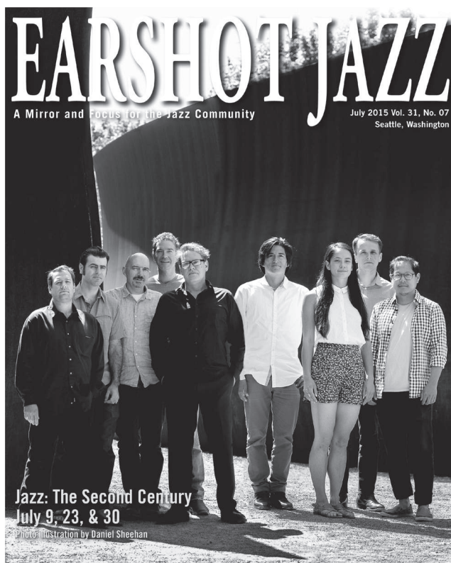
COVER: JAZZ: THE SECOND CENTURY ARTISTS PHOTO ILLUSTRATION BY DANIEL SHEEHAN