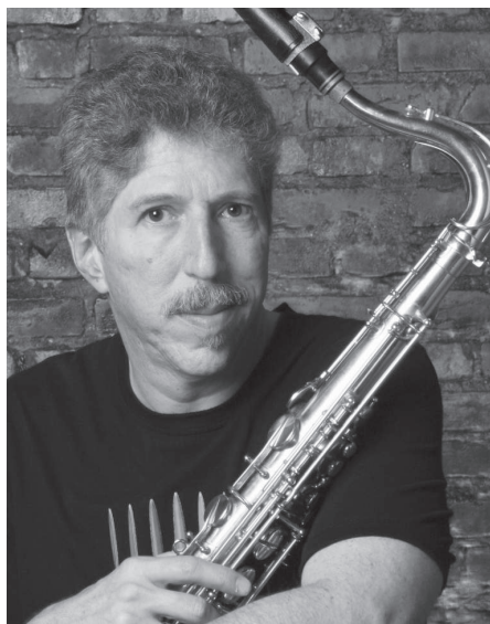
BOB MINTZER

This year's Jazz Port Townsend will host roughly 230 participants for the