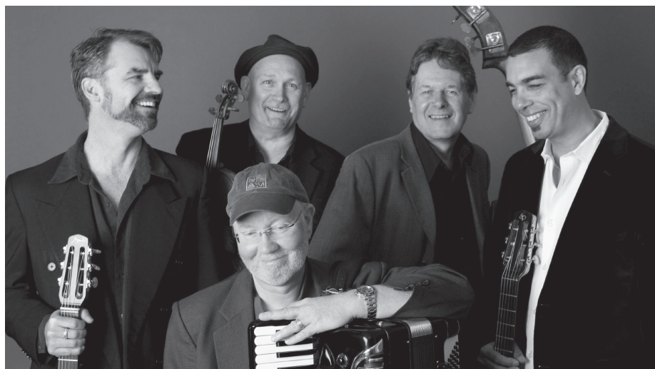
PEARL DJANGO PERFORMS AT NORTH CITY JAZZ WALK ON AUGUST 11.

August 14-16 – Russian Center, Century Ballroom, Washington Hall Performers TBA. www.facebook.com/seattlelindyexchange