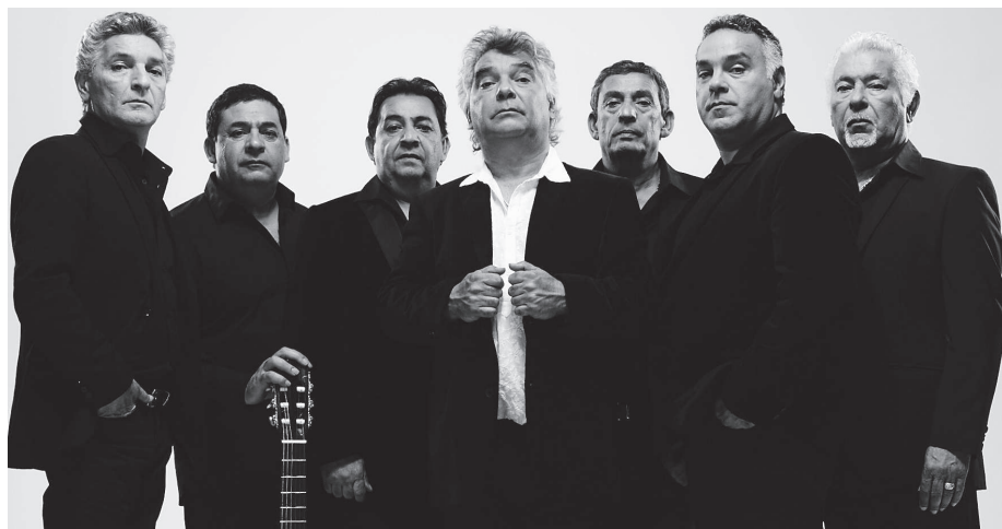
GIPSY KINGS PERFORM AT VARIOUS NORTHWEST FESTIVALS THIS SUMMER.