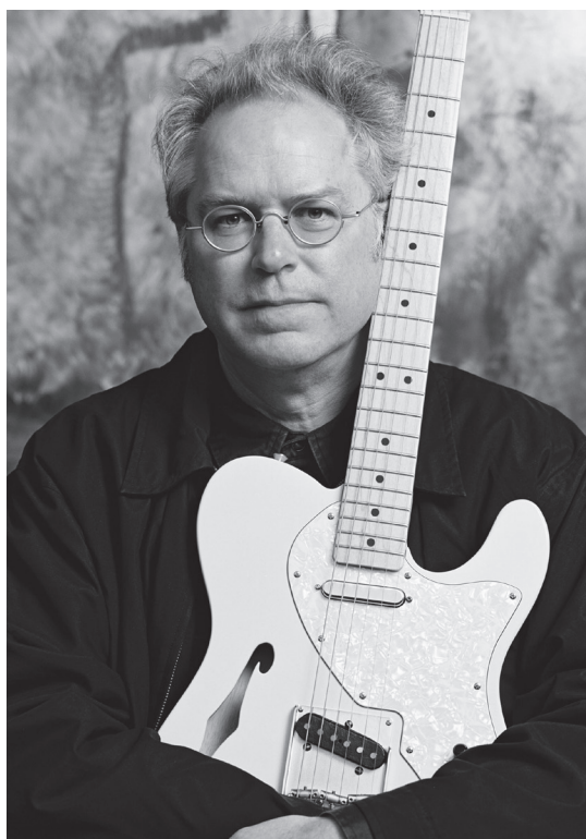
BILL FRISSELL

Born in Baltimore and raised in Colorado, Frisell studied music at both the University of Northern Colorado and Berklee College of Music. His first big break came when Pat Metheny recommended him for a recording session that he was unable to