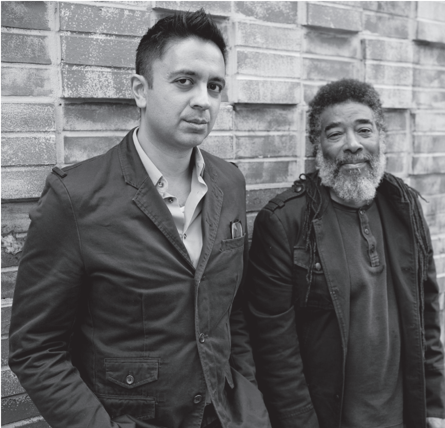
VIJAY IYER & WADADA LEO SMITH