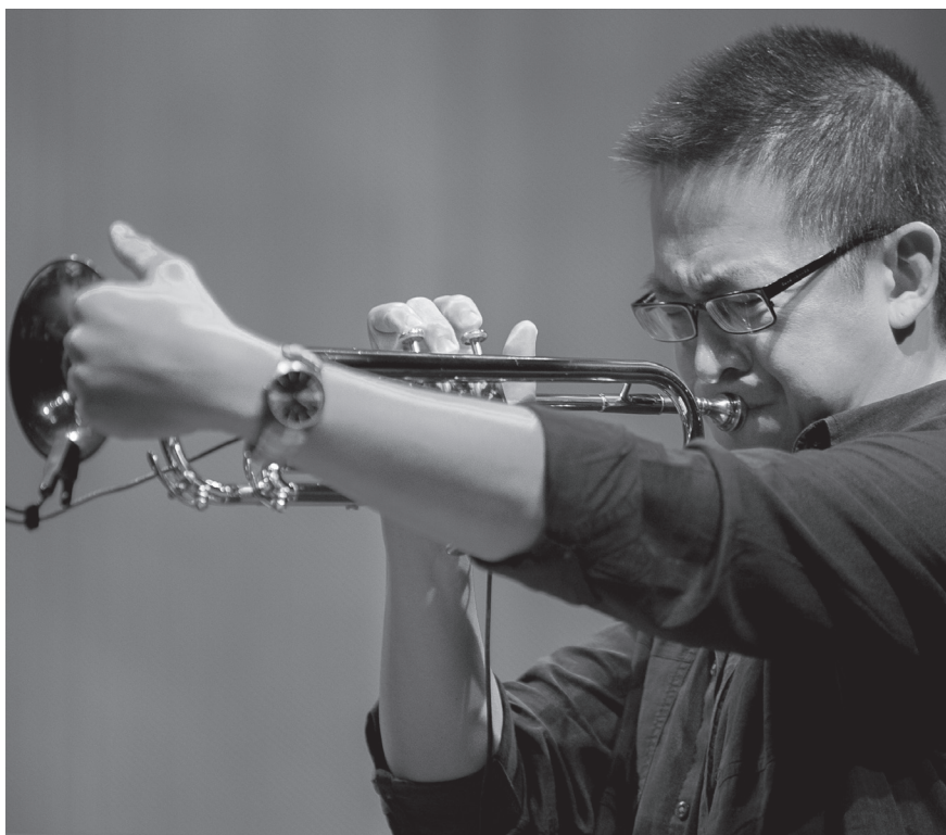
CUONG VU

And don't miss an opening performance by a Seattle JazzED combo, in the Benaroya Hall lobby!