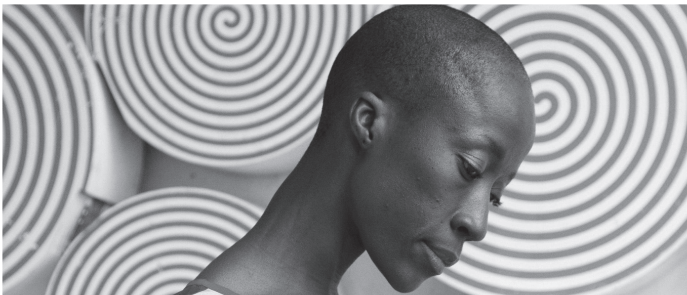
ROKIA TRAORÉ