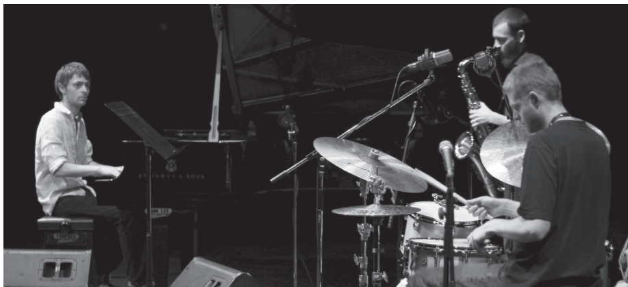
MAMMAL HANDS