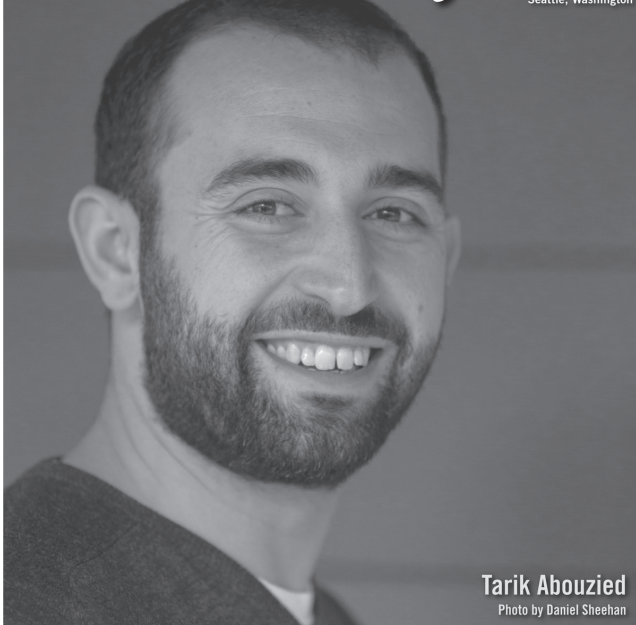
COVER: TARIK ABOUZIED