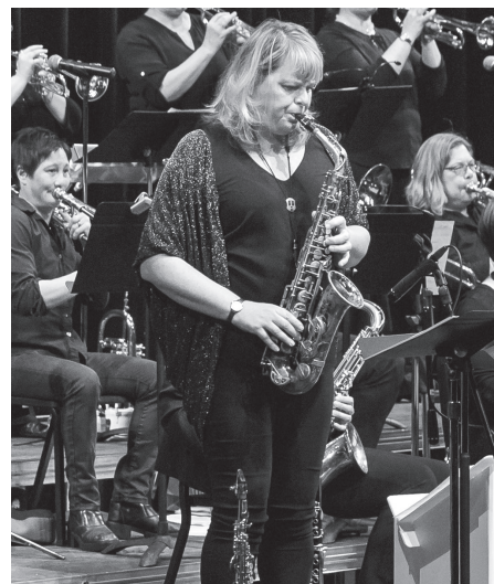
SEATTLE WOMEN'S JAZZ ORCHESTRA

Formerly known as the Out to Lunch concert series, Downtown Summer Sounds brings free local music to downtown Seattle throughout the summer. Produced by the Downtown