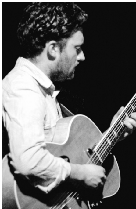
RONAN DELISLE